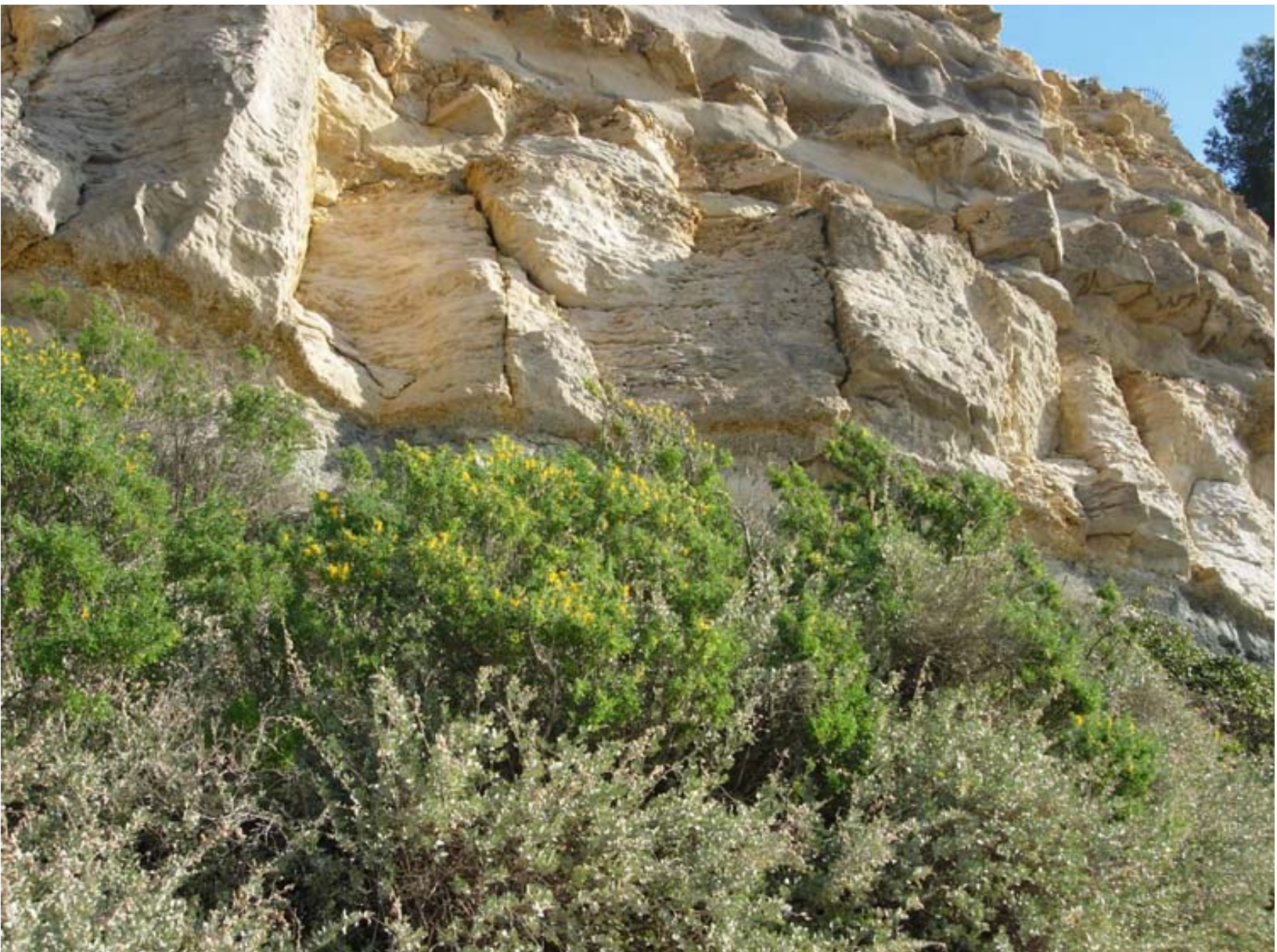
Fig. 1: The yellow-flowered, bright green-leaved M. arborea grows among other Mediterranean shrubs between the sea and small cliffs in the middle of the city of Cassis, France.