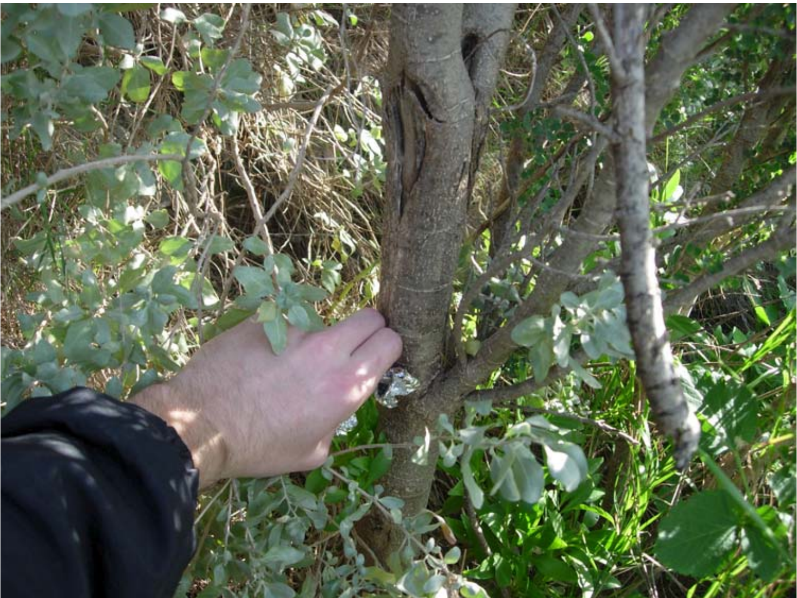
Fig. 4: The trunk of a typical M. arborea from the seaside population. Compare trunk size to the author's wrist. This is a picture of a M. arborea trunk, not of the pale-leaved shrub in the foreground.