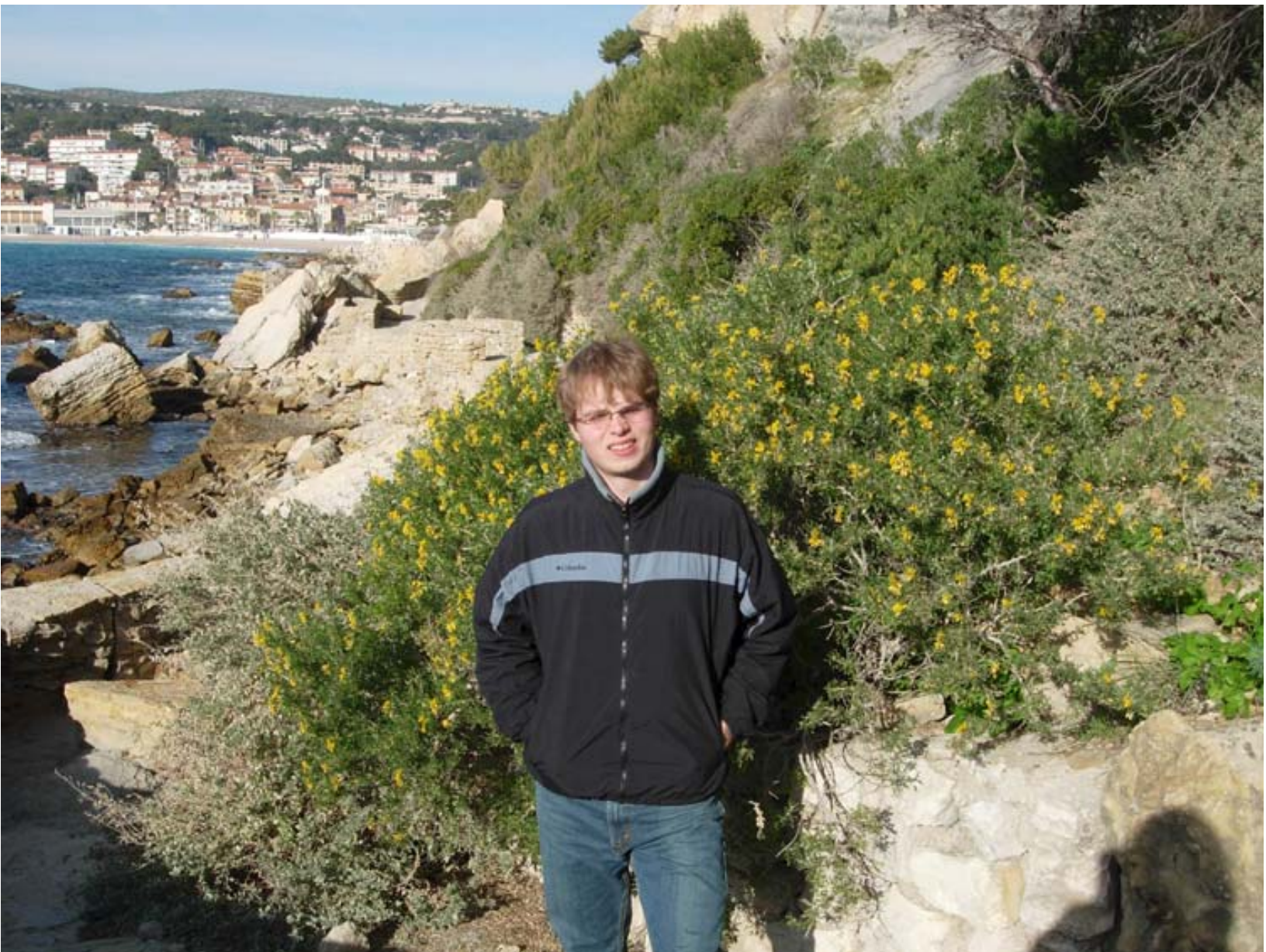
Fig. 5: The author, blinded by the winter morning Mediterranean sun, standing in front of a plant in full bloom. The background shows the beginning of the harbor and part of the city of Cassis.