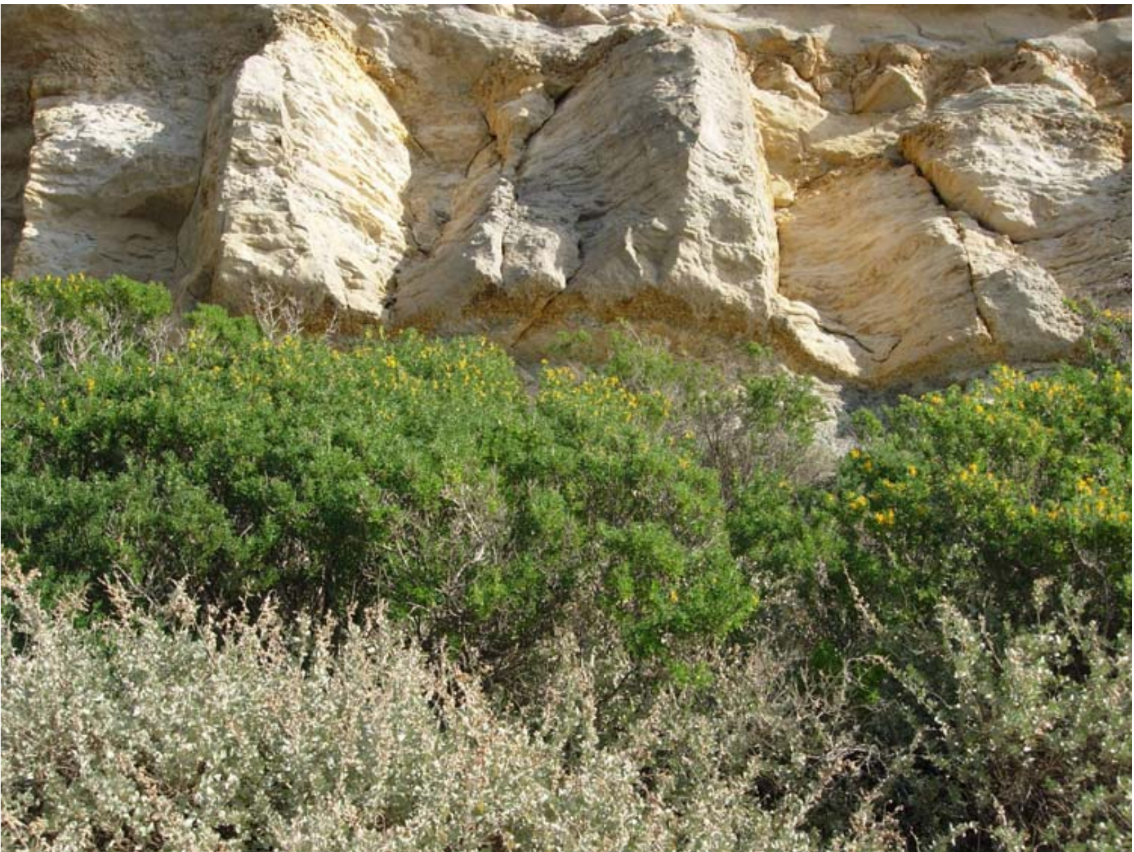
Fig. 2: As in Fig. 1, but taken of plants a few meters east of those in Fig. 1.