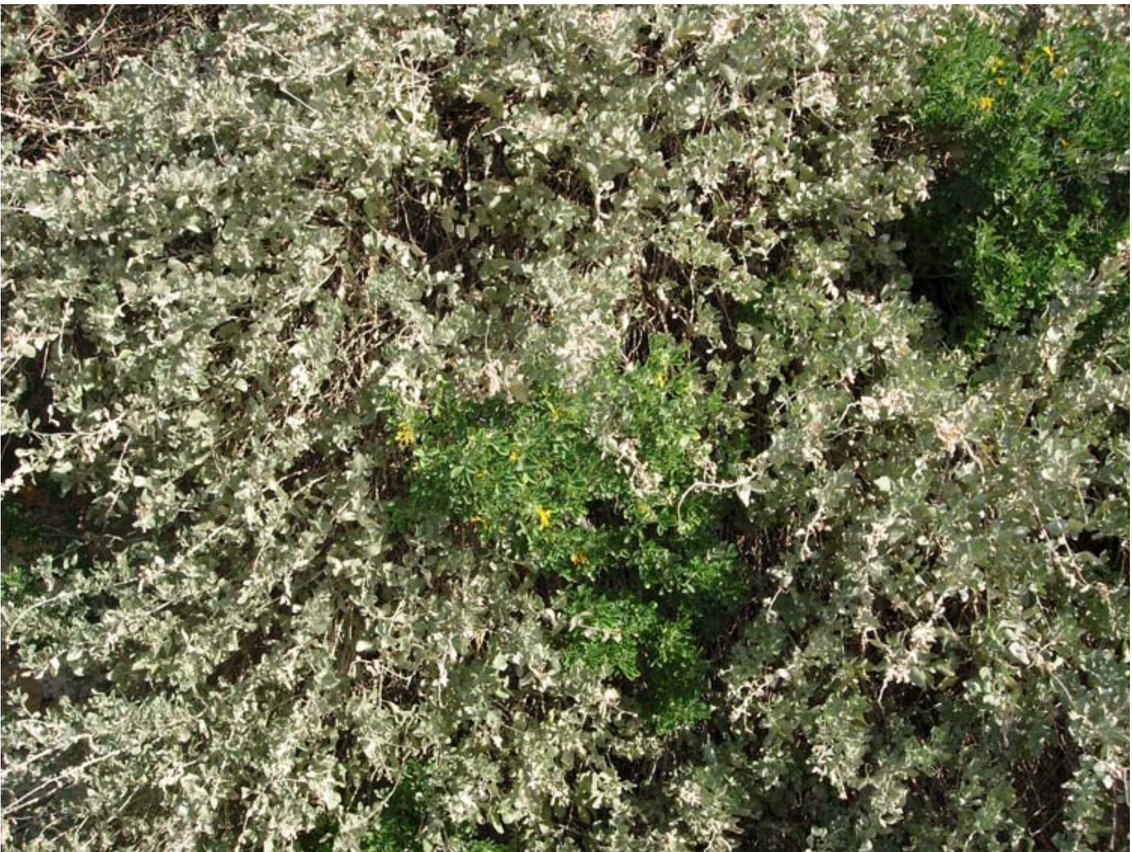
Fig. 3: A few branches of one M. arborea plant poking through the whitish, unknown competing plant.